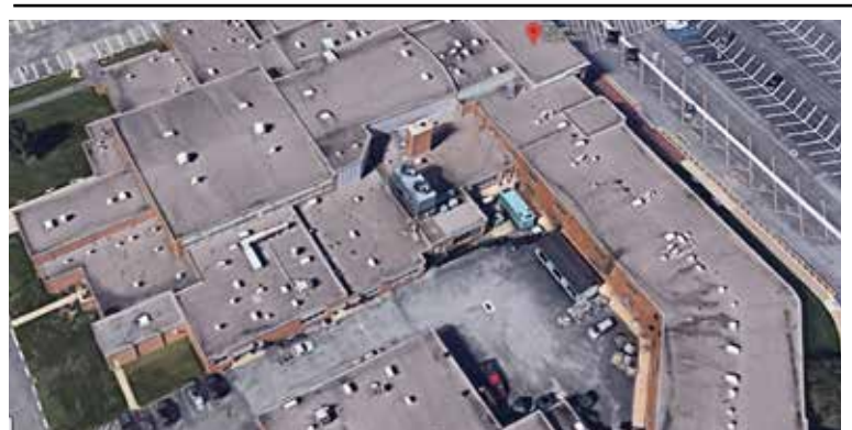
By PASSING the