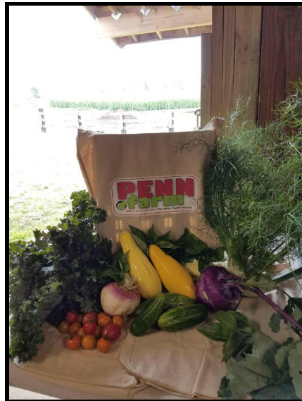
A share from 2018!

The CSA benefits the students of Penn Farm by allowing the students to be able to grow, sell, and answer any questions the consumers might have about the produce. This provides students with valuable business skills in the field of agriculture.