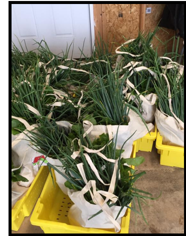
Shares all ready to go!